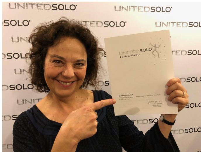
2018 United Solo Festival “Best Festival Debut”