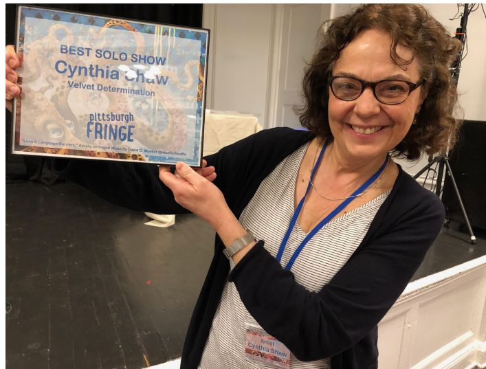
2019 Pittsburgh Fringe “Best Solo Show”