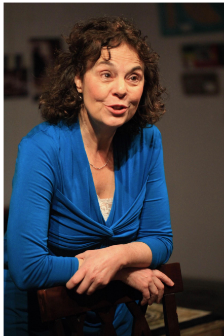
2019 Pittsburgh Fringe