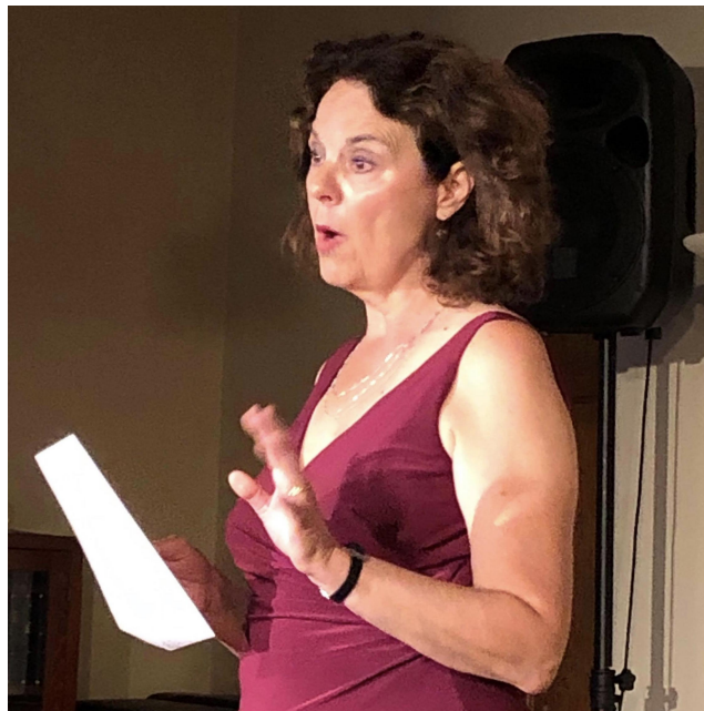
Winner "Best Personal Story" Boulder International Fringe Festival, 2019