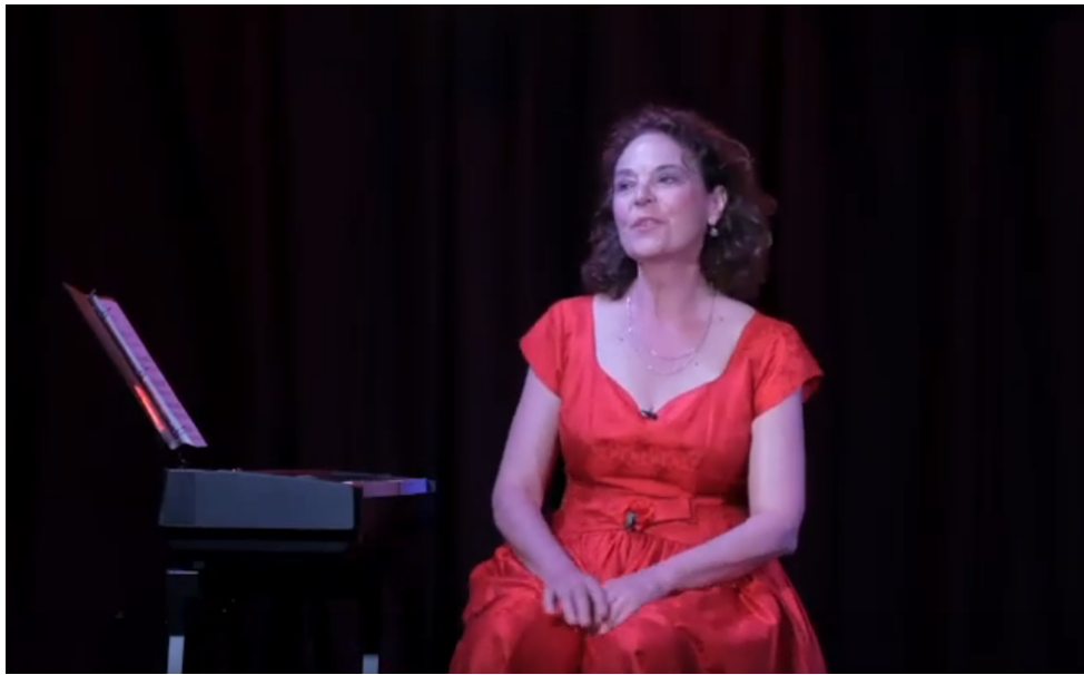
Galway Fringe, 2019 View Video on YouTube

“...honest and engaging...draws you in...leads you to a moment of dramatic truth...”