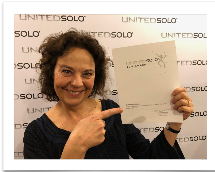
2018 NYC's United Solo Festival (Theatre Row) "Best Festival Debut"

“...an amazing journey...that is both vulnerable and poignant.”