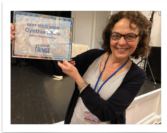
2019 Pittsburgh Fringe "Best Solo Show"

“Her courage and passion for music touch the heart and create a performance that will stay with you.”